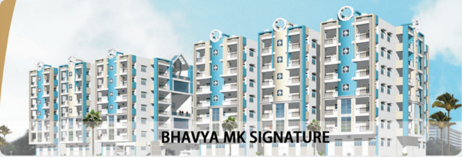
BHAVYA MK SIGNATURE